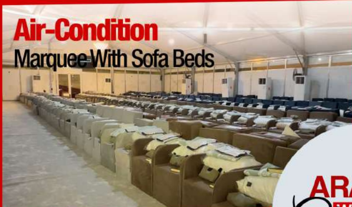
Air-Condition Marquee With Sofa Beds