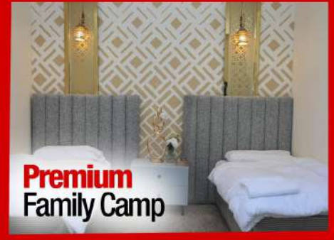
Premium Family Camp