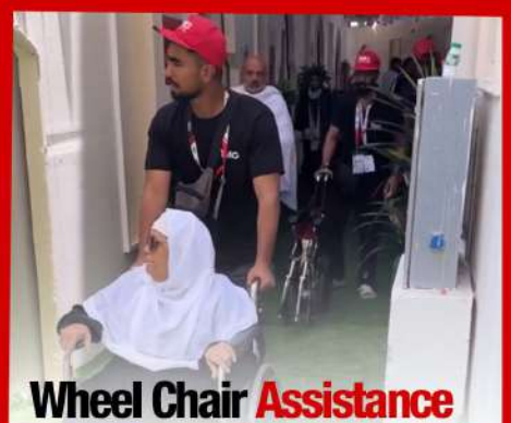
Wheel Chair Assistance