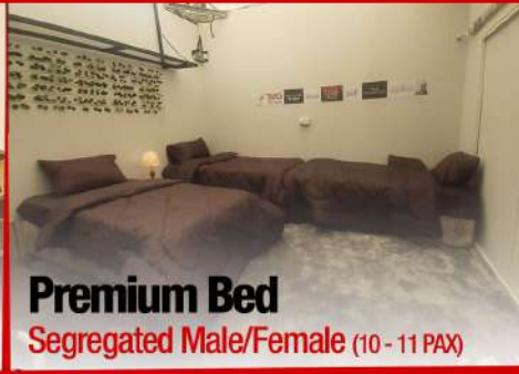
Premium Bed Segregated Male/Female (10 - 11 PAX)