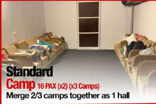
Standard Camp 16 PAX (x2) (x3 Camps) Merge 2/3 camps together as 1 hall